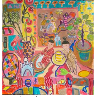
53 Janice Kok Twins Acrylic £290