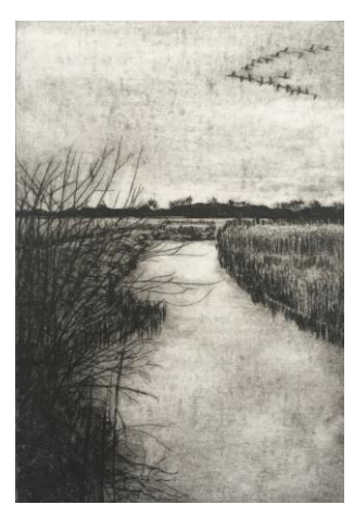
58 Angela Lindsley Moving On Drypoint and Collagraph Print on Paper £110