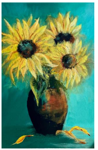
8 Rachel Ashworth-Jerem Sunflowers Acrylic £695