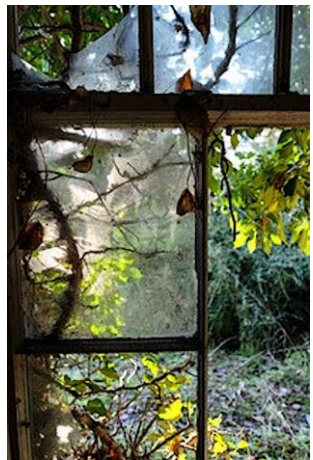
103 Jane Wright Shining Through Photograph