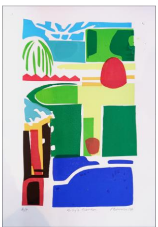
14 Phil Bowman Gilly's Garden Screen Print £200