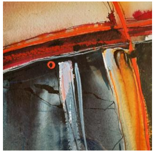
68 David Morris Bridge Watercolour £200