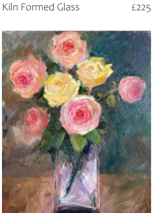
12 Clifford Baxendale A Joy of Roses Oil £395