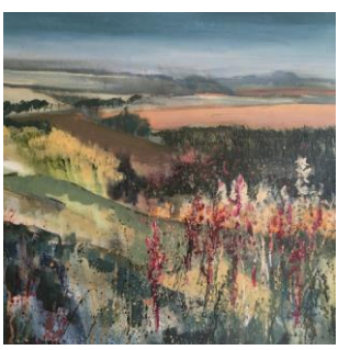
43 Denise Hawthorne Lincolnshire Wolds Acrylic £380