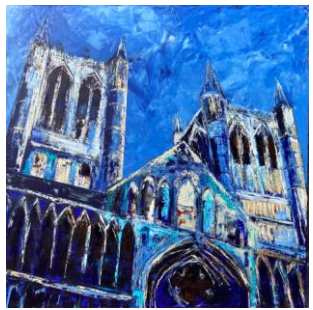
7 Rachel Ashworth-Jerem Cathedral Light Acrylic £995