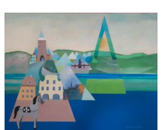
28 Leszek Dabrowski Strange Mirrors Acrylic £600