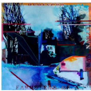
70 Martin Moyers Hemingby AD 1086 Paints and Collage on Birch Panel £400