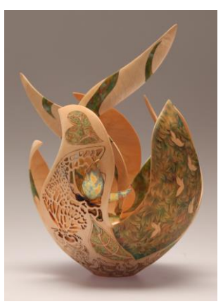
76 Joey Richardson Escape Sycamore, Acrylic Colours £1,900