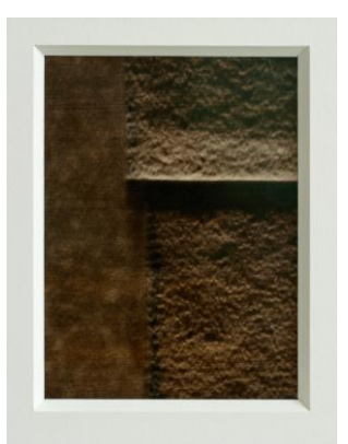
29 Richard Devereux The Dream Will Open By Itself (II) after Olav H Hauge Pigment Dispersal on Aqueous Polyester £750