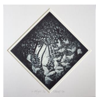
24 Janet Cox In Flight 2/25 Mezzotint