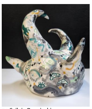
74 Szilvia Ponyiczki Campfire Glazed Ceramics