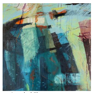
33 Annabel Eley Deep Water Harbour Oil and Mixed Media on Panel £1,400