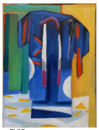
15 Phil Bowman The Kimono Acrylic £260