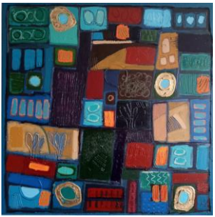
84 Tracey Smith Field Walk 2 Acrylic £300