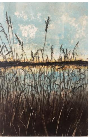
61 Angela Lindsley Water's Edge Drypoint and Monoprint on Paper £110