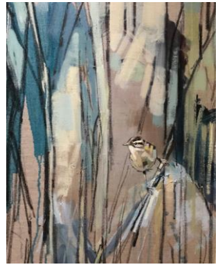
5 Laura Andrew Sedge Warbler Glimpse Oil on Linen