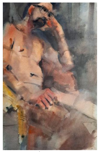
92 Spencer Thompson Time to Think Watercolour £199