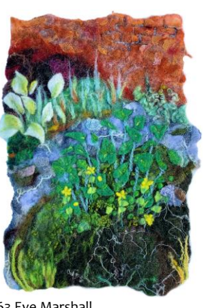
63 Eve Marshall Sitting by the Pond Felted Wool £385