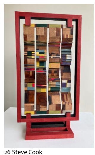
Rock Cycle Series: Sedimentary Hardwood, Veneers £265