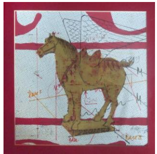
94 Brian Trotter Golden Horse Mixed Media plus Gold Leaf £200