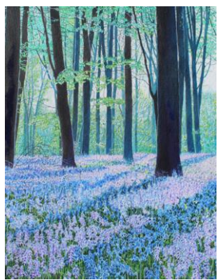
19 Les Brown Bluebell Wood Acrylic on Canvas £350