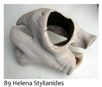
Hollow Lilac wood, Wood Tints, Wax £340