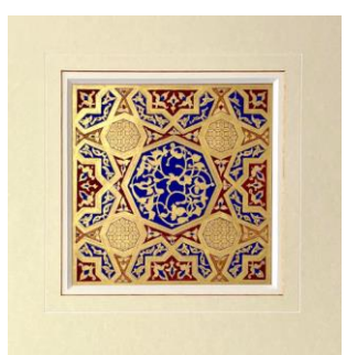
75 Mal Reynolds Baybar MS 42212 Medium Shell Gold and Gouache £2,500