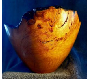
97 Rob Vashak Oak burr vessel English Oak – carnauba wax finish £120