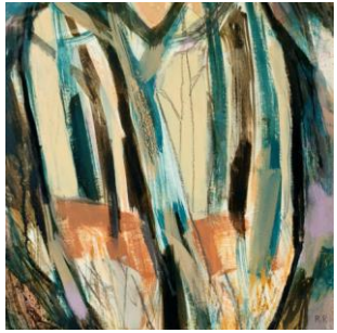
80 Rachel Rogers Kirkby Lane Mixed Media £300