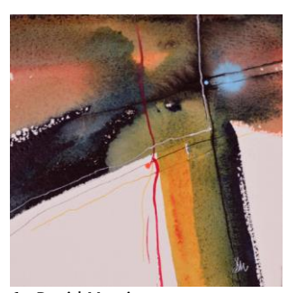
69 David Morris Wash Watercolour £200