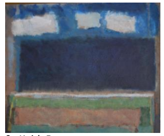
83 Keith Roper Rymac Shoreline Oil £500