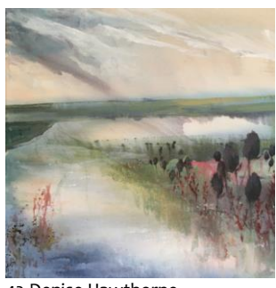
42 Denise Hawthorne Flooded Fields Acrylic £380