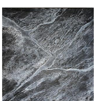
67 Jaq McCaughern The Space Between Mixed Media £250