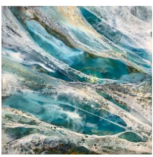
81 Barbara Rontree Troposphere Encaustic £250