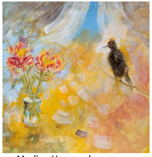
40 Medina Hammad Remembrance – for Claire Mixed Media £400