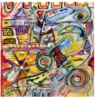
57 Jillian Lewis Glyphs Acrylic £180