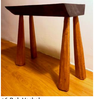
96 Rob Vashak "Modern Rustic" stool Ash – top carved, flamed and ebonised £150