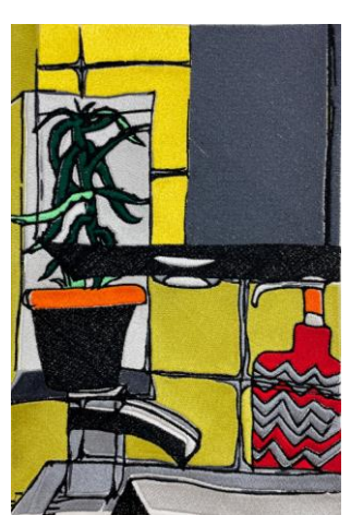
55 Karina Kaye Aloe Vera Embroidered Art Work on Cotton £480