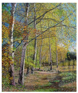
18 Les Brown Autumn Walk Acrylic on Canvas £630