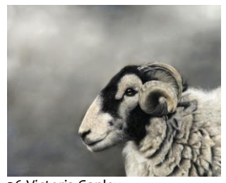
36 Victoria Ganley Swaledale Sheep Pastel £1,600