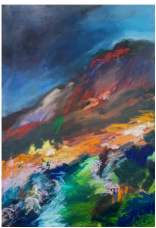
99 Sarah Watson Highland Bracken Oil on Paper £900